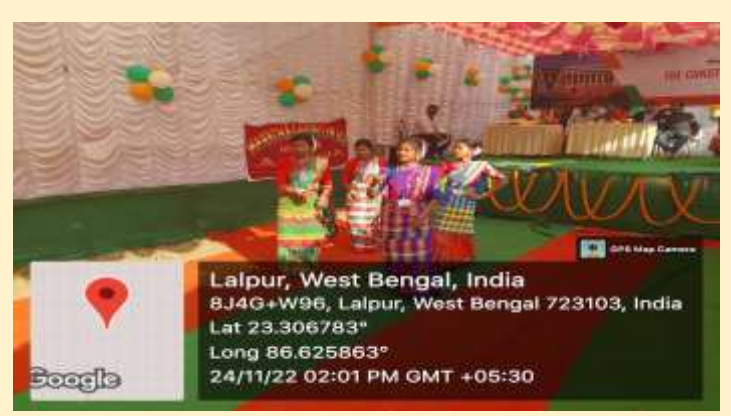
Day-1 Inauguration, Exhibition & Cultural Program