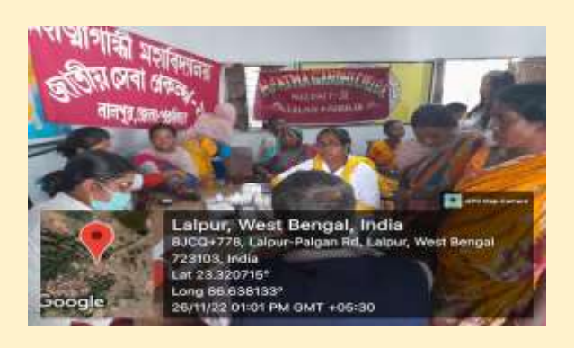
Day 2: Health Awareness Program at tribal Village Hatimara in the scheme EK BHARAT SHRESTHA BHARAT: