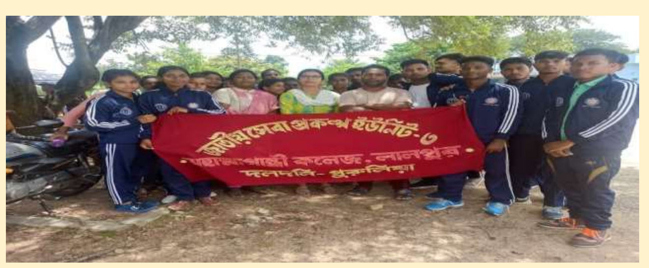
Cleanliness drive at Hura Rural Hospital