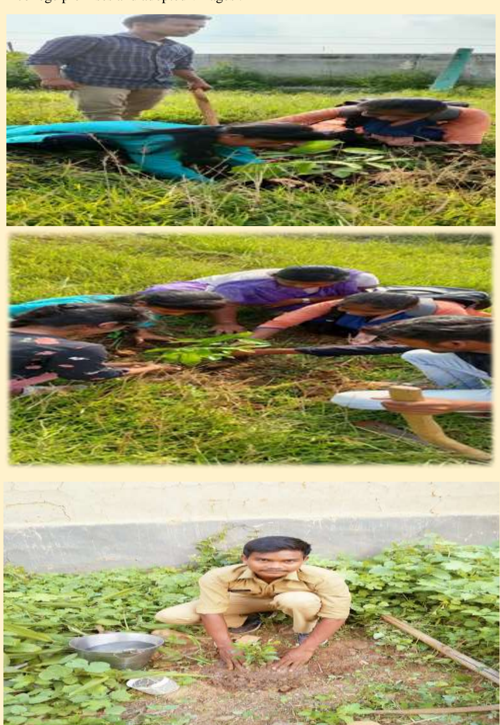
Tree Plantation Week

2. TREE PLANTATION WEEK : (26/08/2022- 31/8/2022): ON THE OCCASION OF Tree Plantation Week, a seven day plantation drive has been taken by NSS & NCC of our college. Nearabout 200 saplings has been planted in college premises and adopted villages .