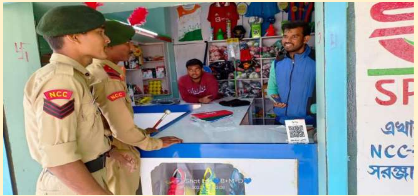
Awareness Program On Plastic Free India

7. NCC DAY Celebration: NCC day which falls on last Sunday of November, 27/11/2022. NCC Cadets deicides to aware local people against the harm of Plastic, so they rallied and visited nearby shops. Present NCC Cadets: 12